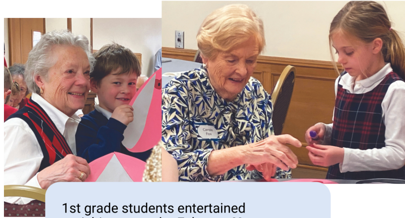
1st grade students entertained parishioners at the February Young at Heart Luncheon with a medley of songs.