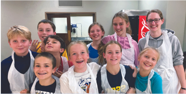
Middle School students participated in the All Saints Meal Program monthly to build habits of service and respect for the community.