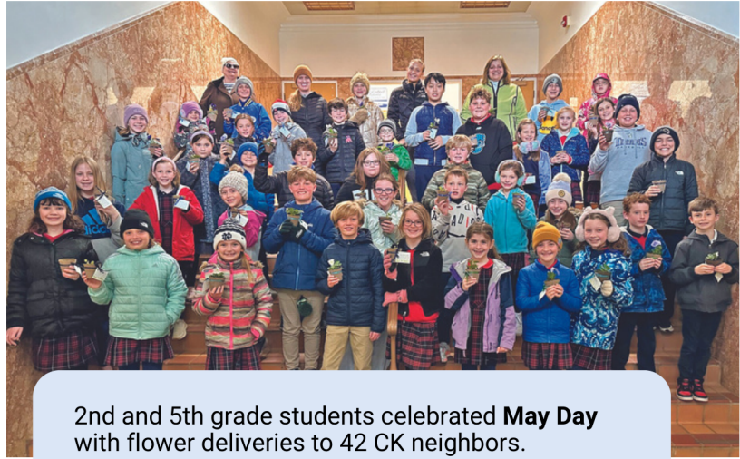
2nd and 5th grade students celebrated May Day with flower deliveries to 42 CK neighbors.