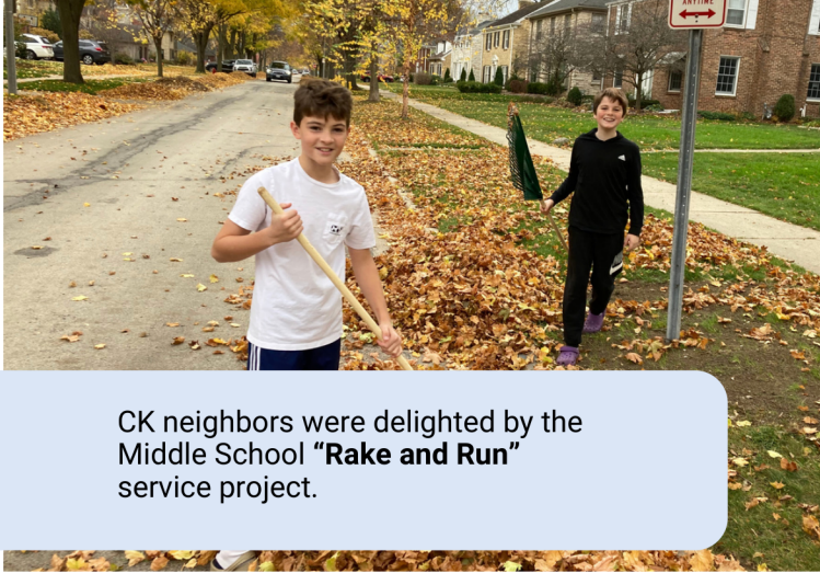
CK neighbors were delighted by the Middle School "Rake and Run" service project.