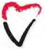
St. Vincent de Paul Society Basic Needs – Compassionate Care

Every family is different and has their own story, but a typical theme is a family in a new home with little to no furniture. Often times, they also need assistance with food and clothing. We will be conducting a special collection at the July 14th and 15th Masses, or you can mail/drop off a donation at the parish office or in the collection boxes at the church entrances. These donations go directly to helping these families. Another SVDP ministry is the North and South side meal programs in which your Share Sunday donations help support. Thank you in advance for your generosity.