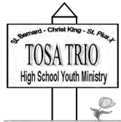
A Sign of Hope...